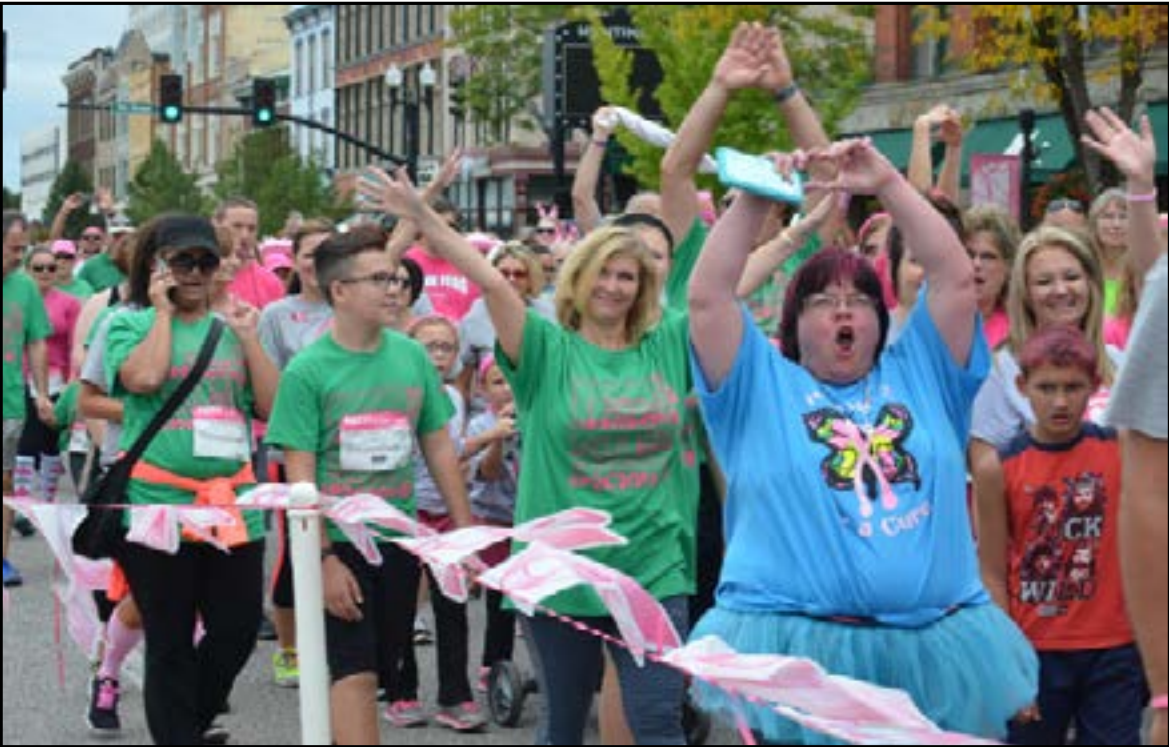
1,787 runners and walkers participated in the PATH to the Cure 5K.