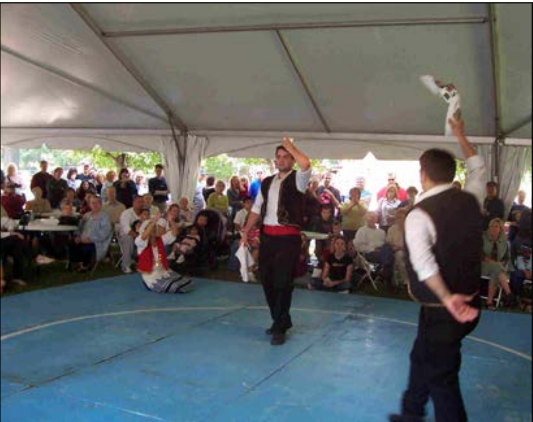
Performers demonstrating Greek dances at St. George Orthodox Church’s annual Greek Festival.