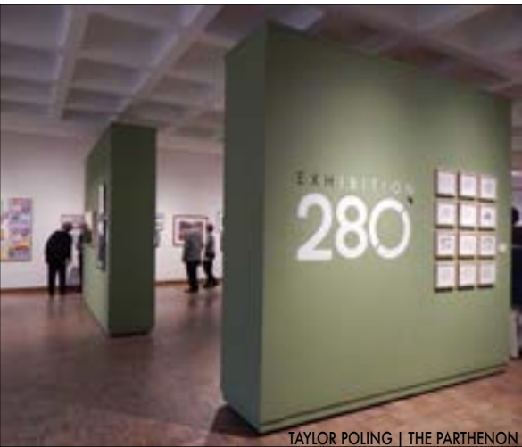
Exhibition 280 has begun at the Huntington Museum of Art.