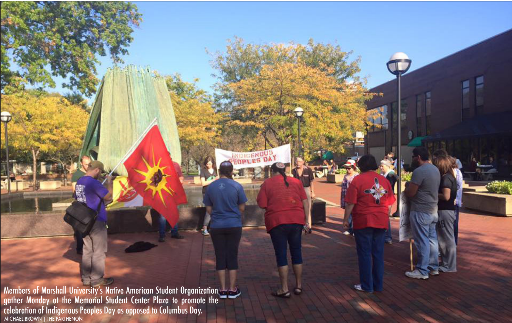
Members of Marshall University's Native American Student Organization gather Monday at the Memorial Student Center Plaza to promote the celebration of Indigenous Peoples Day as opposed to Columbus Day.