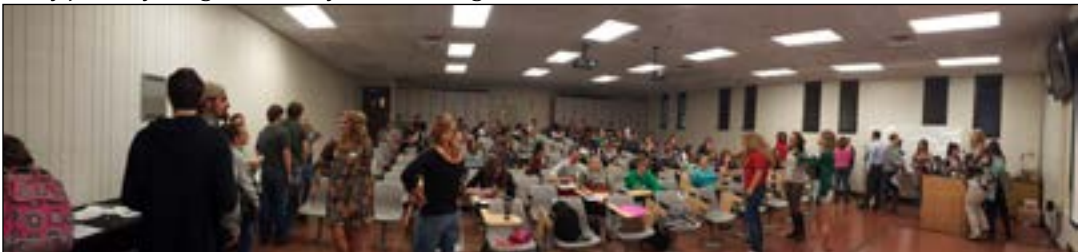
John Marshall Emerging Leaders Institute named Nation Society of Leadership and Success largest club on campus with 250 new members.